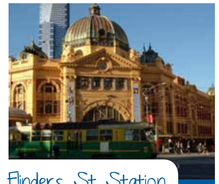
Flinders St Station